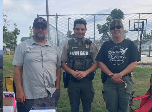
Naturalist, Ranger, and Director at National Night Out