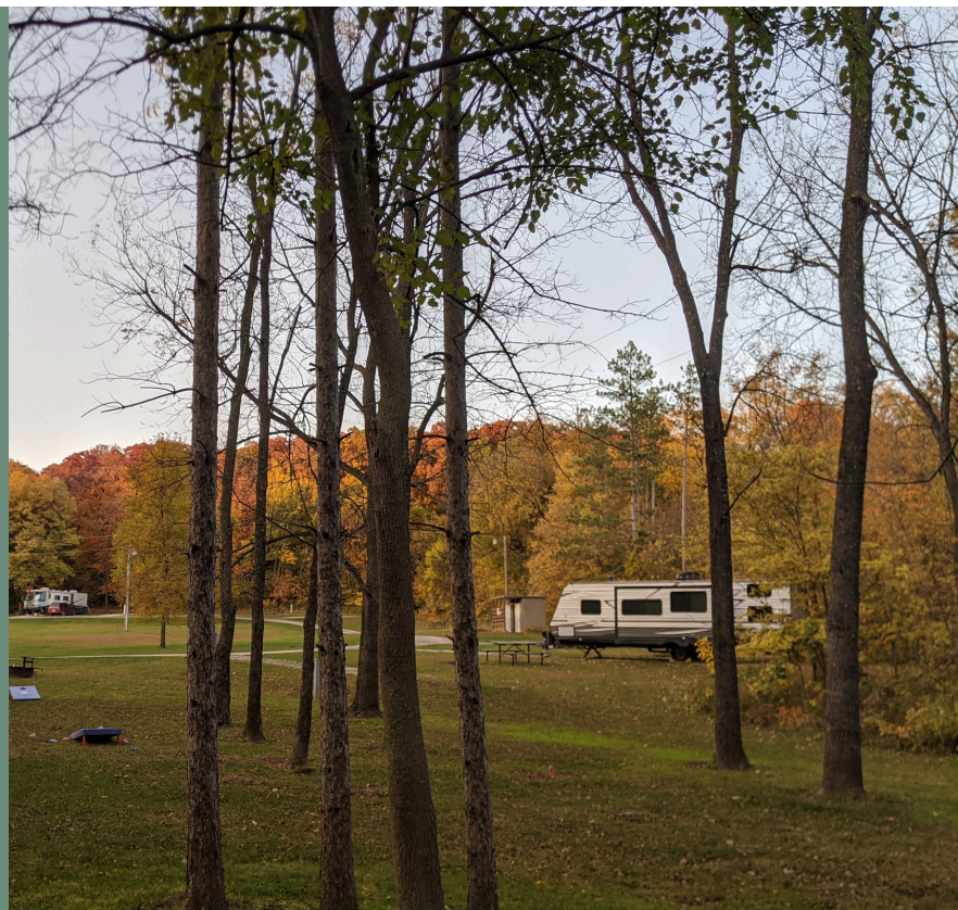
Fall Peace at Wildcat Bluff Recreation Area

info@bentoncountyparks.com bentoncountyia.gov/conservation