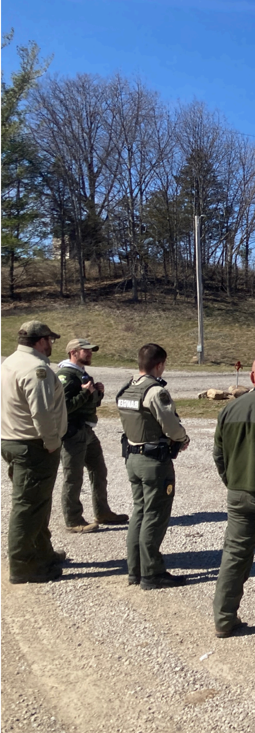
BCCB Rangers hosted the Spring CCPOA Conference