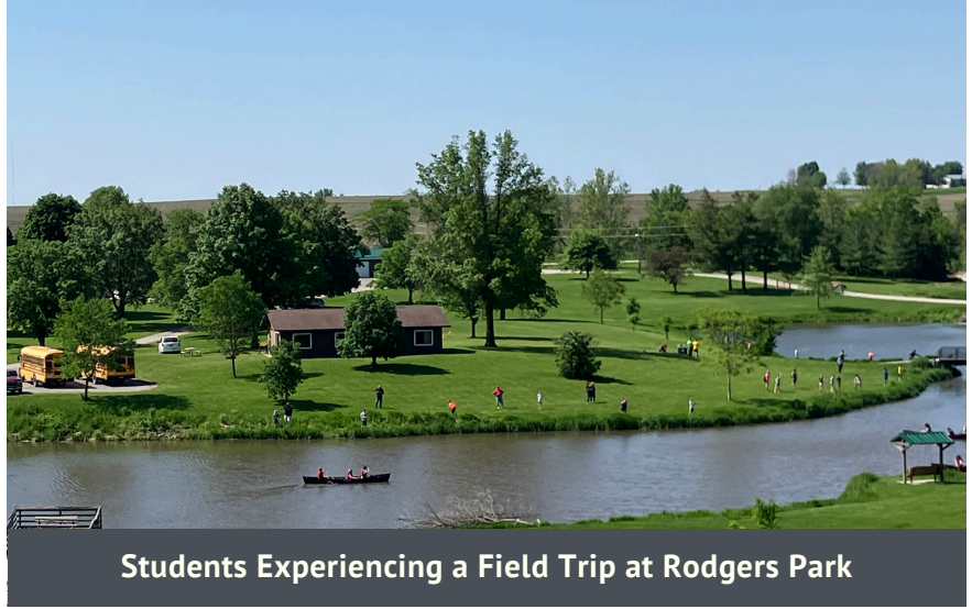
Students Experiencing a Field Trip at Rodgers Park