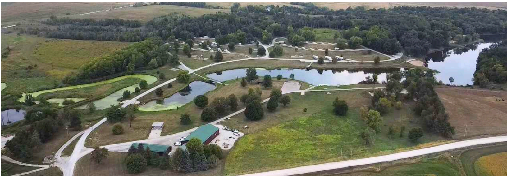
View of Rodgers Park from the South

** This is not including camping revenue fees or any day use benefits. For day use (which would be valued at $25.37 per person per day in 2012), we know that we have several thousand of day-use individuals including disc golfers, hikers, bikers, walkers, anglers, hunters, boaters, and equestrian riders. This brings in additional hundreds of thousands of dollars.