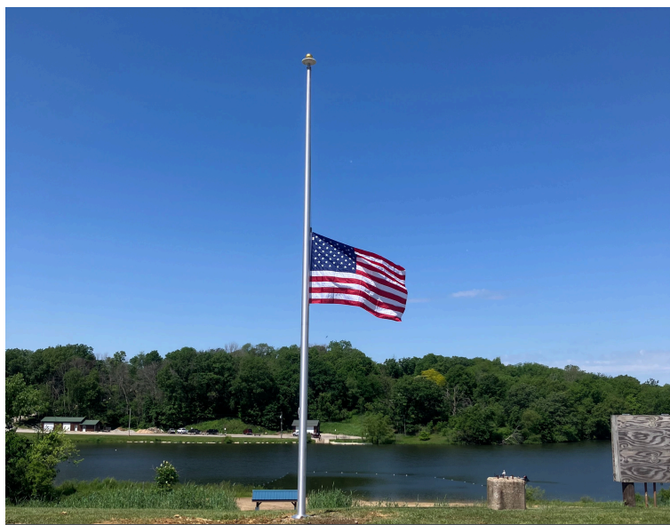
Upgraded Flag Pole at Hannen Lake Park