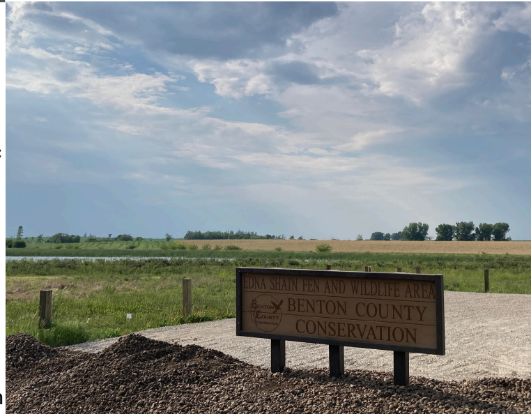
Edna Shain Fen Sign