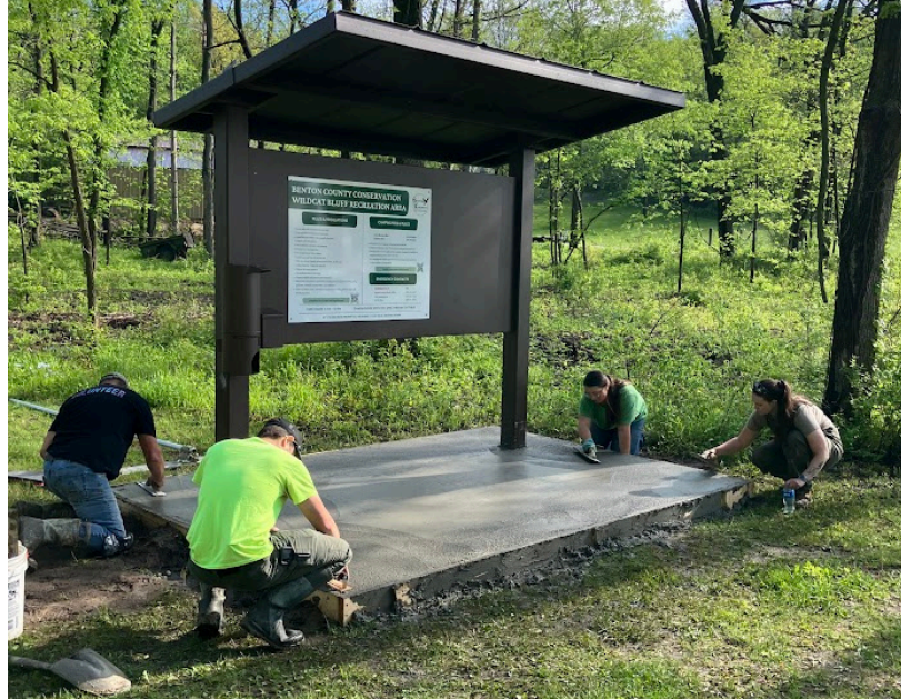
Staff Finishing Concrete Pad for New Kiosk