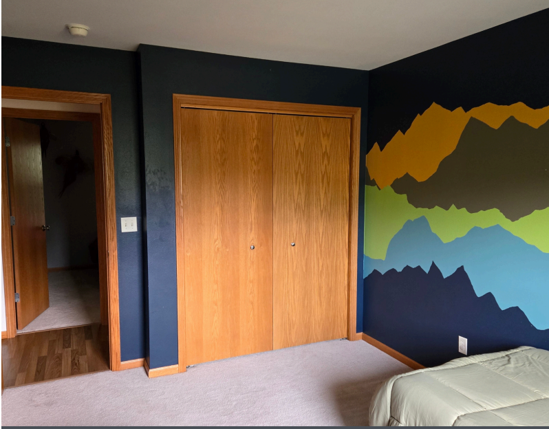
The Den at Wildcat Bluff Recreation Area