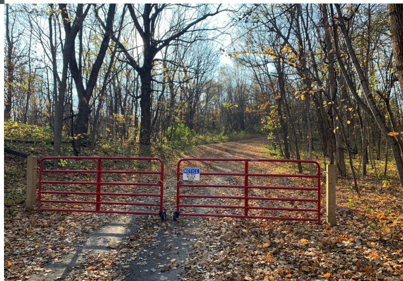
Improved Access to Minne-Estema Park

FISCAL YEAR 2024 DATES JULY 1, 2023 - JUNE 30, 2024