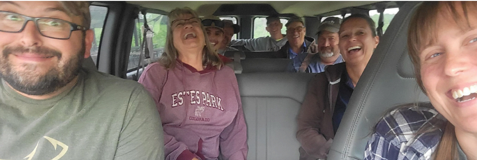
Board and Staff Enjoying a Tour of Conservation Properties

Benton County Conservation improves the quality of life for all by providing recreational and educational opportunities that foster stewardship of our natural resources.