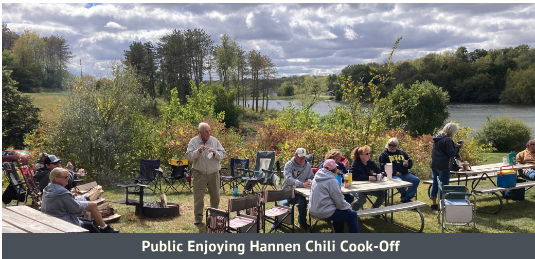
Public Enjoying Hannen Chili Cook-Off