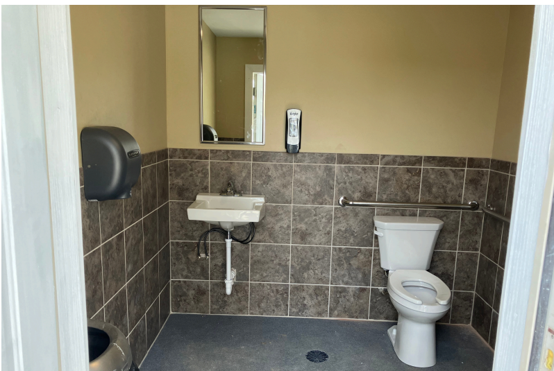
Hannen Lake Park West Shop Restroom