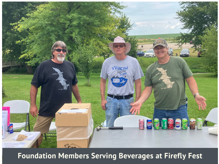
Foundation Members Serving Beverages at Firefly Fest

We are lucky to have so many wonderful volunteers that help with various events and projects, advocate for us, and serve on our Benton County Conservation Foundation Board.